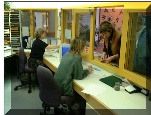
A dialysis patient updates her emergency contact information with her dialysis unit. Dialysis patients require treatment three times a week for approximately four hours per treatment.

An important and related piece of the Conditions for Coverage is the Interpretive Guidelines (IG). The IGs provide guidance for state surveyors in conducting surveys of providers participating in the Medicare program. They clarify and/or explain the Conditions for Coverage and are used in measuring compliance with Federal requirements. The purpose of the guidelines is to provide suggestions, interpretations, checklists, and other tools for the surveyor to use throughout the survey process.